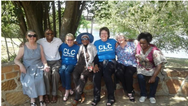
National Assembly La Verna September 2017