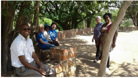
National Assembly La Verna September 2017