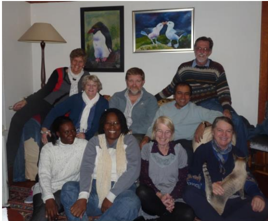
National Exco May 2013. Meeting with SA National Exco and Botswana .