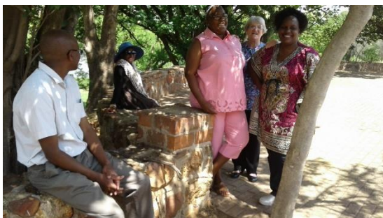
National Assembly La Verna September 2017