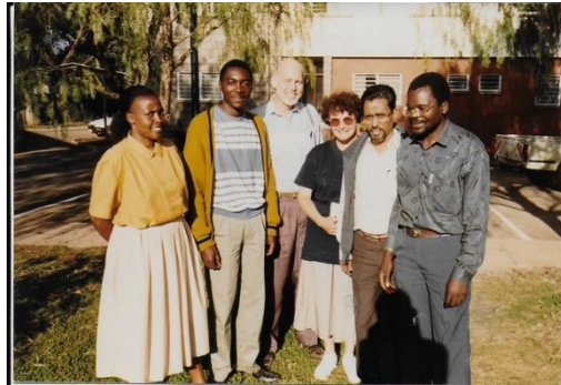
Planning Meeting for IFE, Hekima College, Nairobi