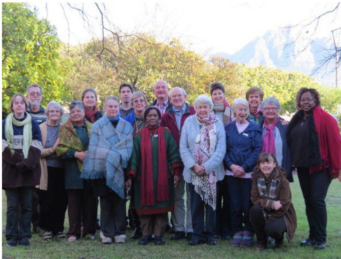
NATIONAL ASSEMBLY CAPE TOWN: 2014