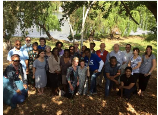
National Assembly La Verna September 2017