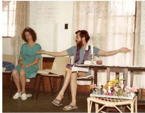
CLC Convention 1992, Port Elizabeth